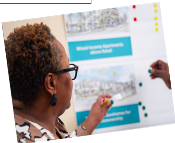
Resident Advisory Committee Meeting - Development Feedback