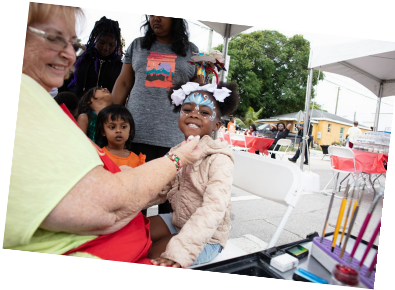
Coleman Park Holiday Celebration - Face Painting